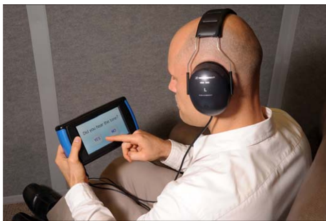
Figure 1. View of OtoID screen. Subject was presented with listening interval and required to make behavioral response (yes or no) regarding whether tone was heard. Presentation intervals contain “catch” trials (interval with no stimulus) to determine threshold reliability.

All testing occurred on three separate days within 1 month and was done in a sound-attenuated booth and in a quiet area of a hospital treatment unit on each day. All manual-mode testing in both ears was done by the same licensed audiologist. Self-testing of the seven individualized SRO frequencies using the automated mode was done by the subjects. All initial evaluations by the audiologist included behavioral hearing testing (0.5–20.0 kHz) and subsequent determination of the individualized SRO, defined as the uppermost frequency, R, with a threshold of \leq 100 dB SPL followed by the next adjacent six lower frequencies in one-sixth octave steps, R-1 through R-6, all < 100 dB SPL. Initial testing location (hospital treatment unit vs sound suite) was counterbalanced for each subject. The 3-day testing sequence was kept the same, including