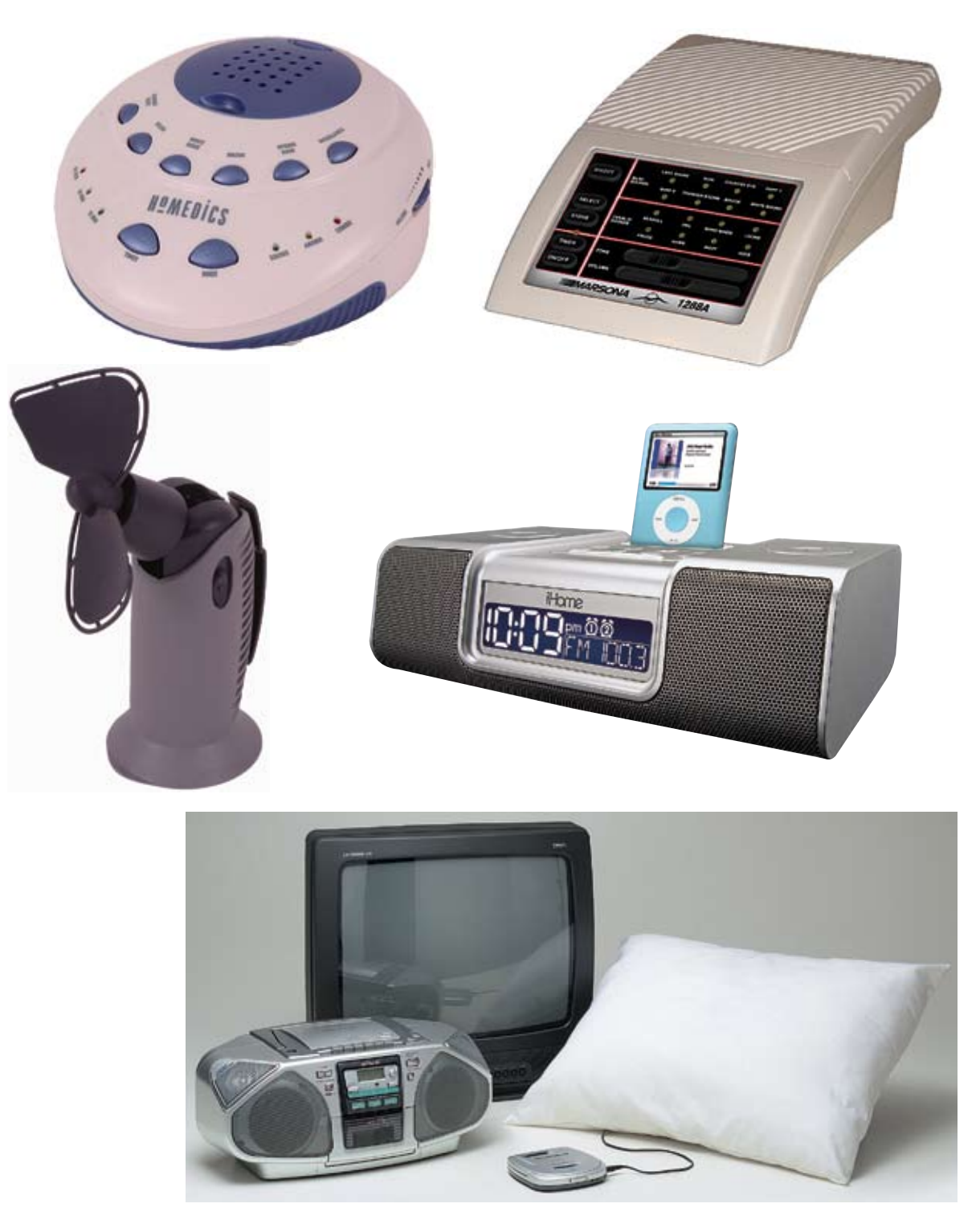
Photo of Marsona sound machine courtesy of Marpac Corporation Photo of HoMedics sound machine shown with permission from HoMedics, Inc. Photo of iHome radio and docking station courtesy of KIDdesigns, Inc. Photo of Sound Pillow courtesy of Phoenix Productions & Promotional Products

If you have trouble sleeping because of tinnitus, a tabletop sound device next to the bed may help. "Sound pillows" offer another listening choice.