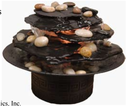
Photo of tabletop fountain shown with permission from HoMedics, Inc. 96

although no longer popular, are still options especially for music and talk formats. Radios offer many program choices. Satellite Radio is available in tabletop models. Tabletop water fountains and electric fans provide steady background sound. Any of these devices can be useful in a quiet setting where you spend time. They are helpful in the office, bedroom, and reading areas.