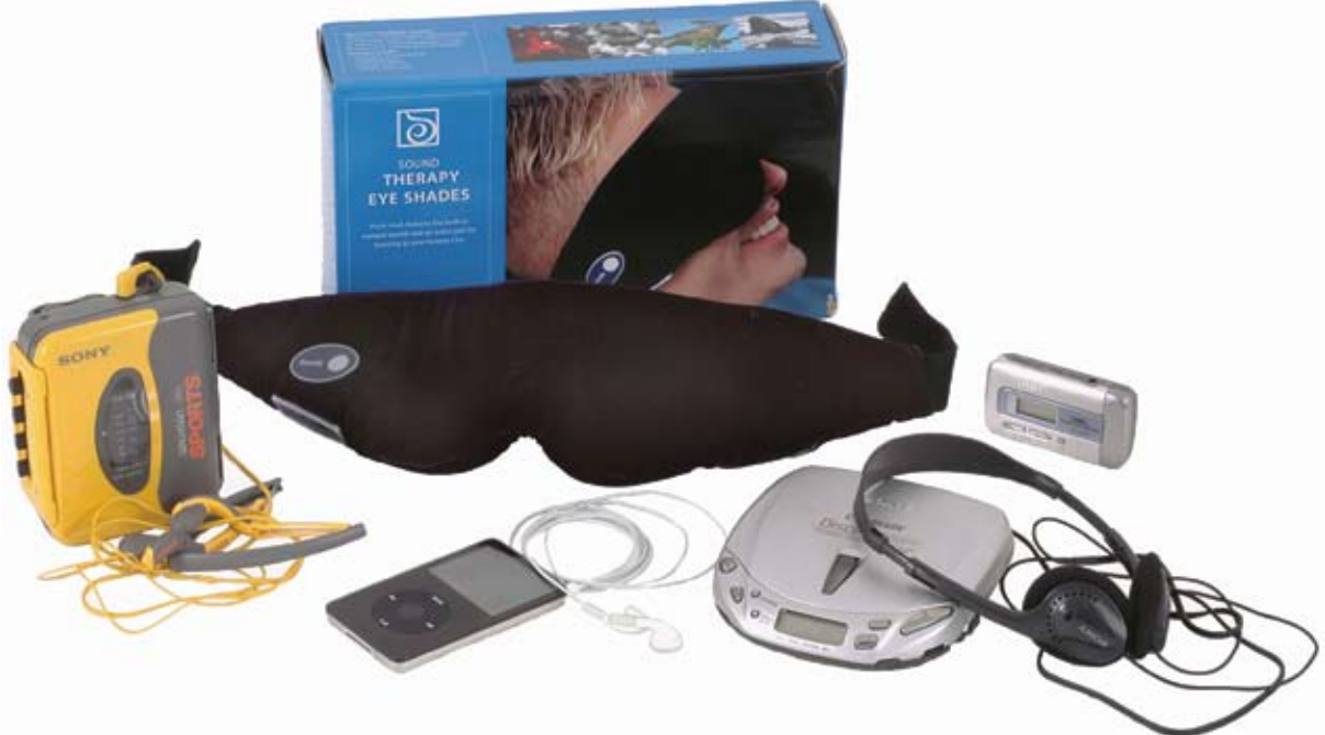
Photo of eye mask shown with permission from Brookstone Photo of Sony cassette player, CD player and Aiwa radio shown with permission from Sony, Inc. Photo of iPod shown with permission from Apple, Inc.

Wearable listening devices include radios, CD players, cassette tape players, and MP3 players. Some cell phones (like the Apple iPhone) play music. Others have radios built in. Wearable listening devices can be used to manage your tinnitus in almost any setting. If you need hearing aids, then there are options to connect hearing aids with wearable listening devices (described later).